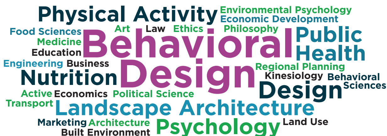
FIGURE 1: EXAMPLES OF DISCIPLINES CONTRIBUTING TO BEHAVIORAL DESIGN

This multidisciplinary effort is fostered within NCCOR, which brings together four of the nation's leading health research funders—the Centers for Disease Control and Prevention (CDC), the National Institutes of Health (NIH), the Robert Wood Johnson Foundation (RWJF), and the U.S. Department of Agriculture (USDA)—to address the problem of childhood obesity in America. These leading national organizations work in tandem to manage projects and reach common goals; combine funding to make the most of available resources; and share insights and expertise to strengthen research. NCCOR focuses on efforts that have the potential to benefit children, teens, and their families, and the communities where they live, learn, work, and play. NCCOR places a special emphasis on the populations and communities where obesity rates are highest and rising the fastest, namely: African-Americans, Hispanics, Native Americans, Asian/Pacific Islanders, and children living in low-income communities.