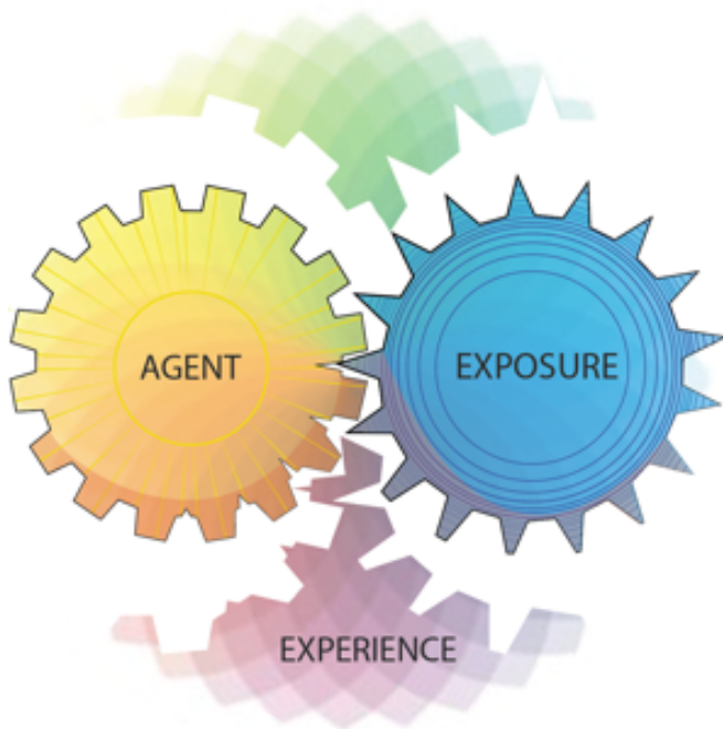
FIGURE 2: OUR EXPERIENCE AS AN INTEGRAL PART OF BEING AN AGENT WITHIN A FIELD OF EXPOSURE.

Behavioral design’s maturation requires drawing from the base domains of human experience to explore, contextualize, and guide our understanding of the relationship between our actions and the natural and built environment. 33,34 The importance of a domain-level approach should not be underestimated. Because this approach goes beyond systems or even ecologic approaches and, if done with care, enforces considerations from the different ways we think and act. Moreover, a domain-level approach tempers and guides behavioral design to respect and protect freedom, rights, autonomy, and, in general, sovereignty. Developing a methodological approach to behavioral design assists our ability to be effectively inclusive of the complex nature of humans and the potential to modify our world toward particular ends. Ideally such an approach is guided and informed by an overarching conceptual framework containing principles representing the fundamental domains and a methodology