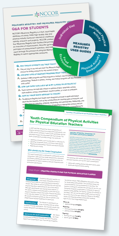
Youth Compendium Fact Sheet for PE Teachers