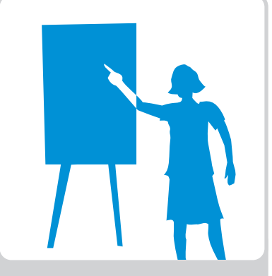
9 Communicate results and findings

a. Provide interim progress reports at member meetings and webinars