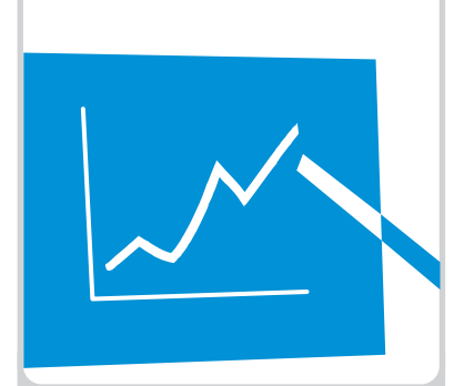
Evaluate outcome and impact

a. Provide interim progress reports at member meetings and webinars